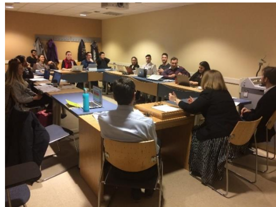
A session of the joint uOttawa-Queen's TradeLab Clinic

Fisheries Subsidies: Buenos Aires and Beyond Summarizing developments and charting way forward for progress at the WTO.